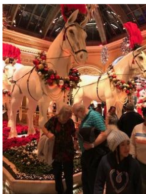
Impressive Carriage horses made of flowers at the Bellagio Hotel in Las Vegas!