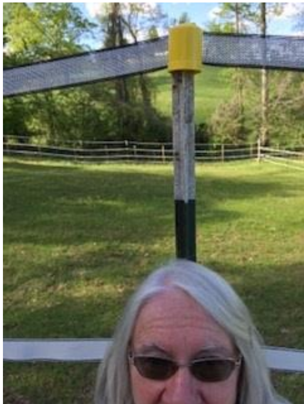
I am 5'6" fence is now 80" tall

We just spent all day Thursday through Easter Sunday putting in 8' T-posts around the front & side perimeter of our property since Precious got out AGAIN Thursday morning! This is the 2 nd time she has escaped within a month. The fence is now about 80" tall! Do YA think this MIGHT keep her in... especially after we get it electrified?