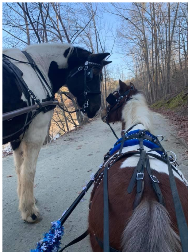
"Mutt & Jeff" at Salem Lake